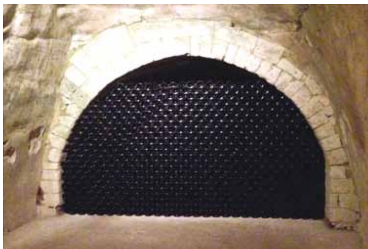
This page from top: The fireplace in the lounge, Relais Christine; Taittinger entrance; Wine bottles stacked in the caves, both from Taittinger Estate